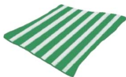
a beach blanket